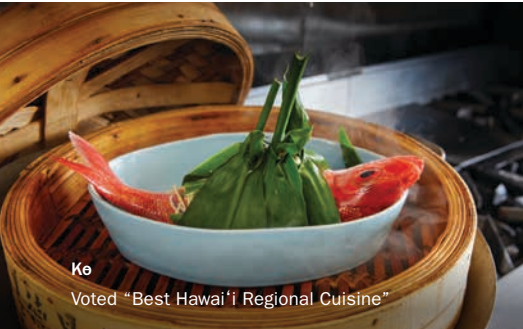
Kei Kō Voted "Best Hawai'i Regional Cuisine"