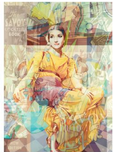
Maria Callas: A Moment of Respite