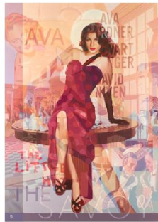
Ava Gardner: A Desirable Proposition