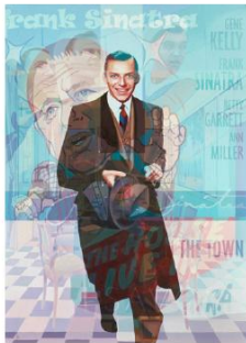
Frank Sinatra: Man About Town