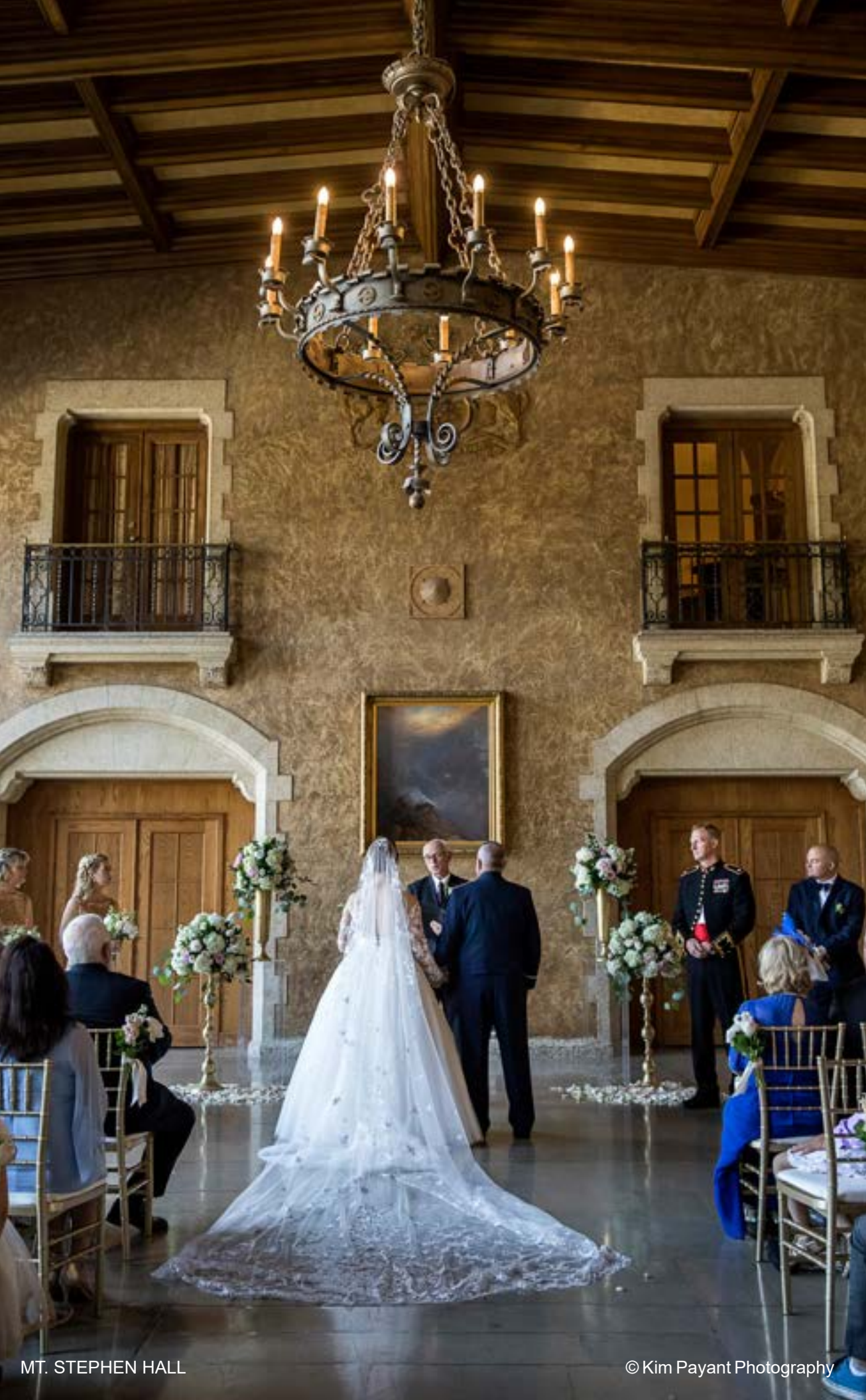
MT. STEPHEN HALL