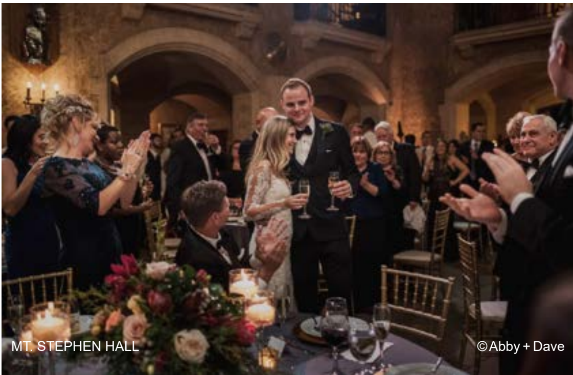
MT. STEPHEN HALL