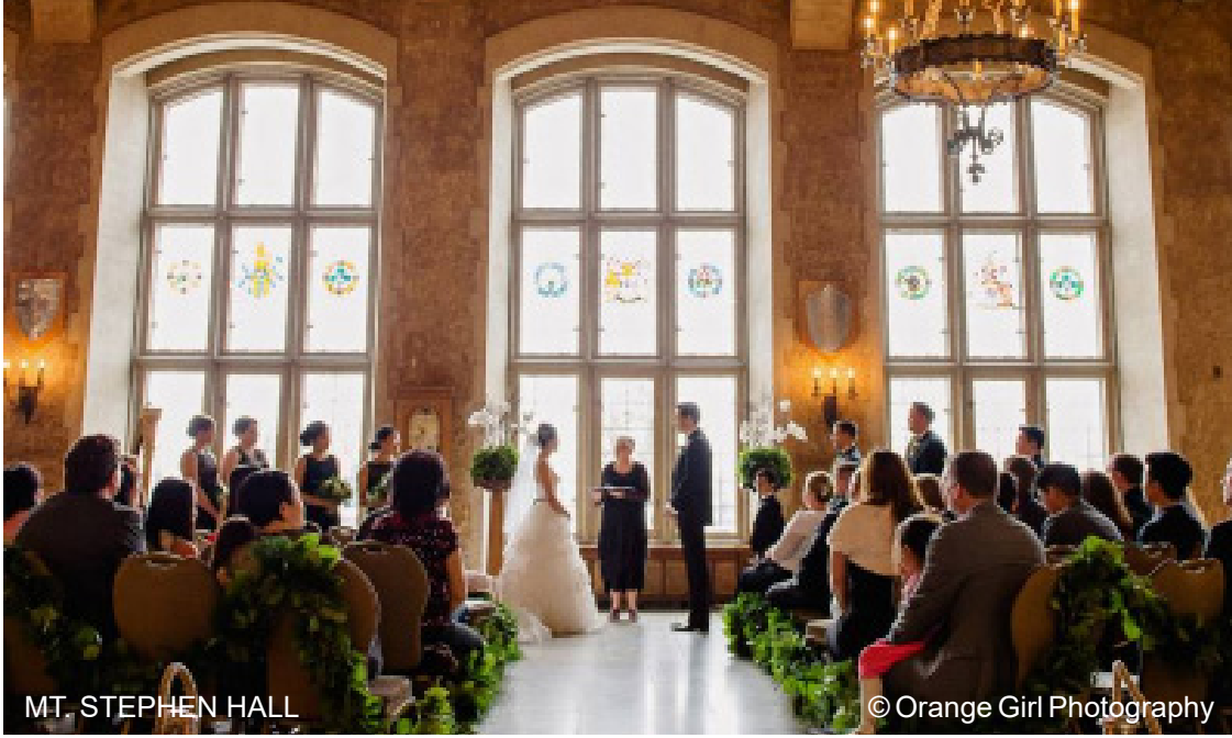
MT. STEPHEN HALL