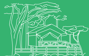
MARA SAFARI CLUB

At Fairmont Kenya, it is not only the Fairmont excellence that we offer to guests, we also take them through an unforgettable journey into Kenya's history as well as looking towards the future and sharing with guests our conservancy projects.