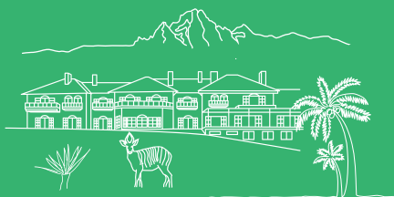
MOUNT KENYA SAFARI CLUB