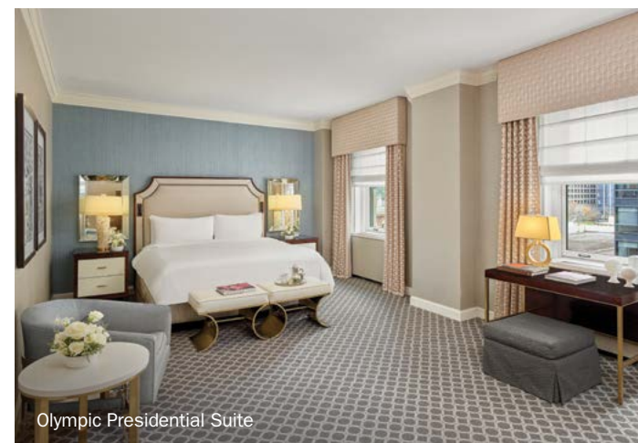
Olympic Presidential Suite