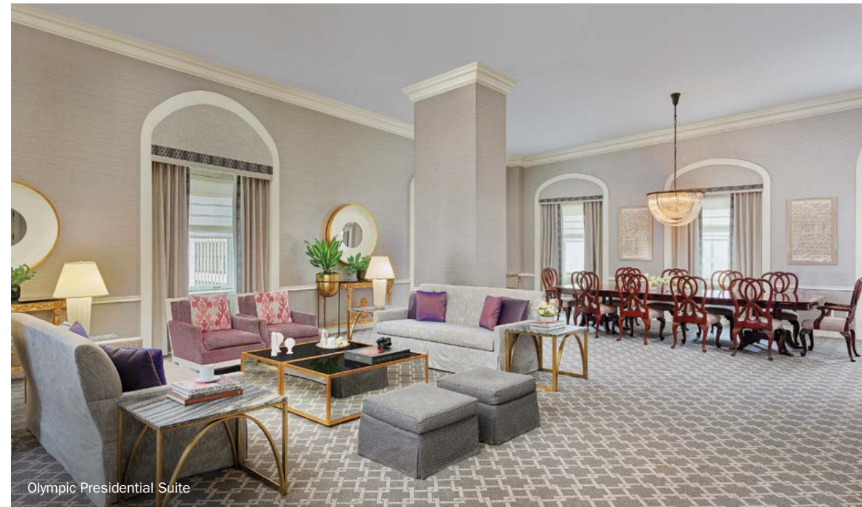
Olympic Presidential Suite

This sophisticated suite offers the convenience of a separate bedroom and living area for comfort.