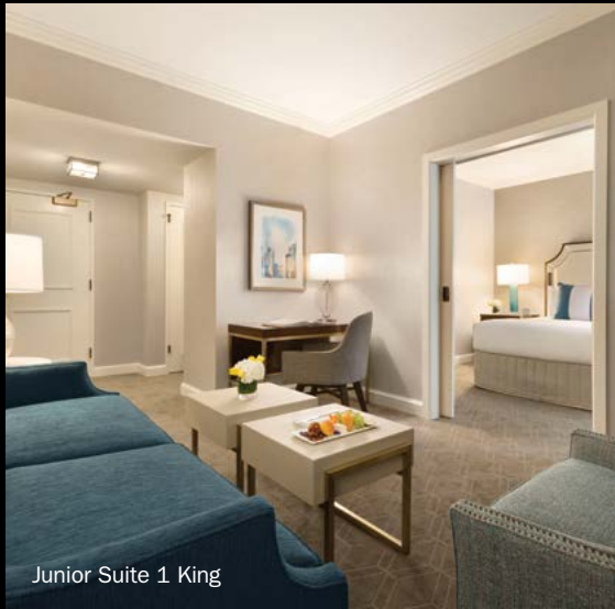
Junior Suite 1 King

Our 450 guest rooms and suites provide spacious blends of comfort, style and functionality. Designated workspaces and marble bathrooms with walk-in rain showers—accompanied by full-sized Le Labo bath products, sumptuous bathrobes and Nespresso coffee makers—ensure deeply satisfying stays for every guest during your event.