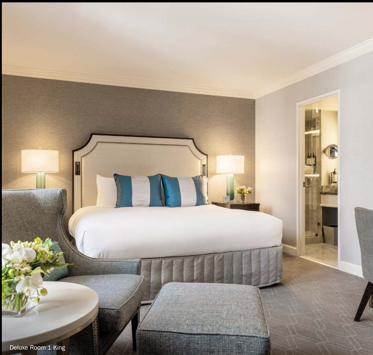
Deluxe Room 1 King

Our 450 guest rooms and suites provide spacious blends of comfort, style and functionality. Designated workspaces and marble bathrooms with walk-in rain showers—accompanied by full-sized Le Labo bath products, sumptuous bathrobes and Nespresso coffee makers—ensure deeply satisfying stays for every guest during your event.