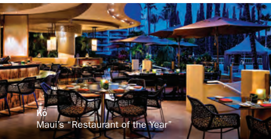
Kō Maui’s “Restaurant of the Year”