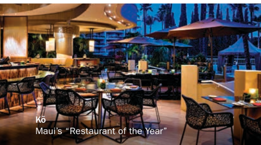
Kō Maui’s “Restaurant of the Year”