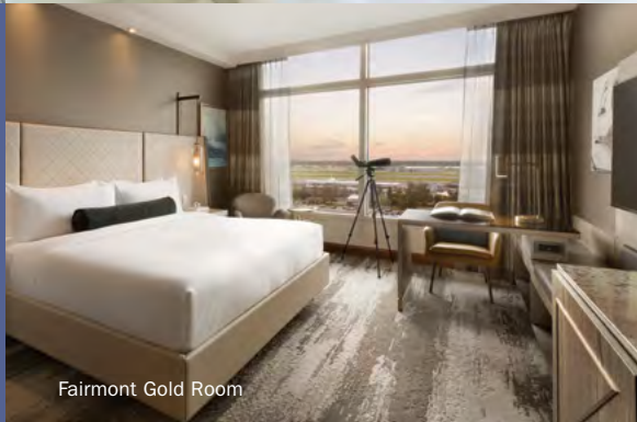
Fairmont Gold Room

Adorned with breathtaking sculptures by esteemed First Nations artists and situated perfectly for views of the majestic North Shore Mountains, Vancouver International Airport is an ideal gateway to Canada's West Coast. And whether you're here for an overnight stay or a longer layover, Fairmont Vancouver Airport connects you to far more than just your next flight: cuisine that embodies the best of the Pacific Northwest; sumptuous, soundproofed guest rooms for truly restorative rest; a spa and fitness centre to ease the strain of jetlag. And with a location inside the airport itself that puts you just steps from departure gates, it's no wonder Fairmont Vancouver Airport has been voted the best airport hotel in North America.